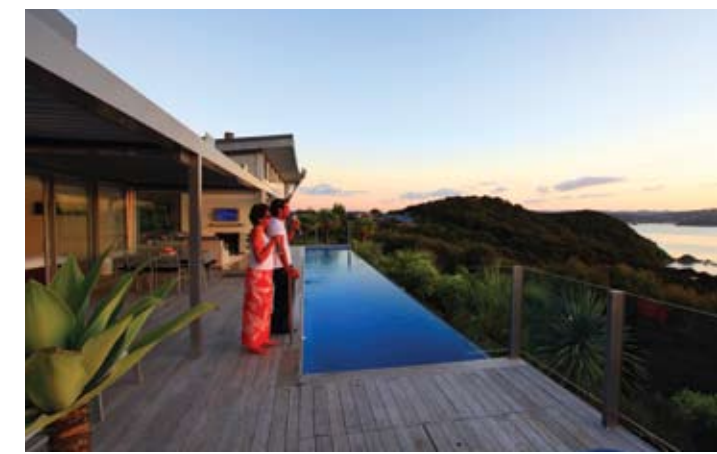
Left: Massage Therapy at Eagle's Nest Right: Eagle Spirit Villa deck

creeping into the lead. A thrilling tacking duel ensued and the finishing gun signalled our hard fought 3 second victory.