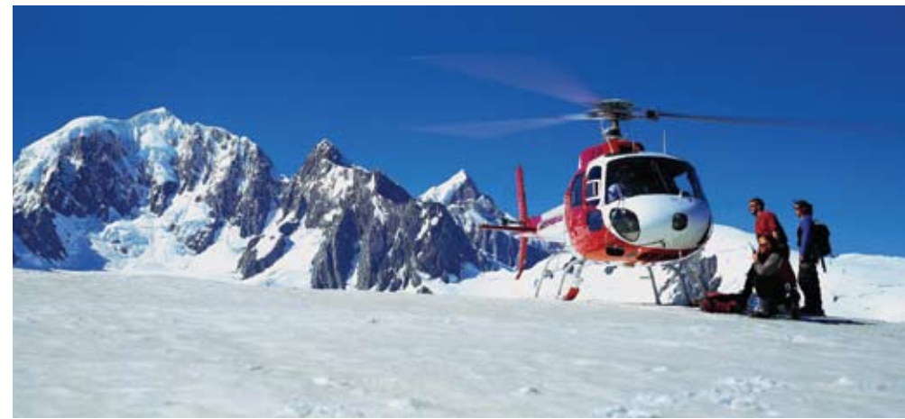
Left: Trout fishing Right: Helicopter flight to Fox glacier

Board: "New Zealand wine is an experience like no other. Our special combination of soil, climate and water, our innovative pioneering spirit and our commitment to quality all come together to deliver pure, intense and diverse experiences. In every glass of New Zealand Wine is a world of pure discovery."